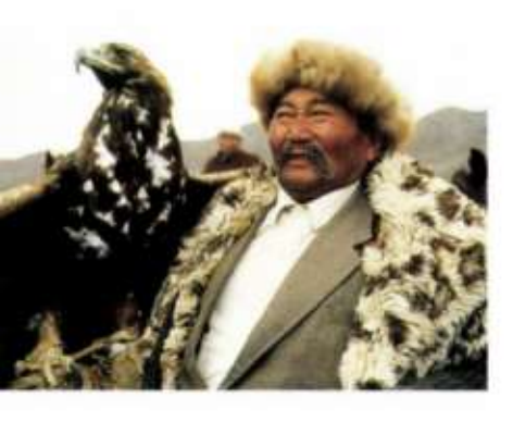
▲ A Kyrgyz tribesman of the Eurasian Steppe region, with his hunting eagle.