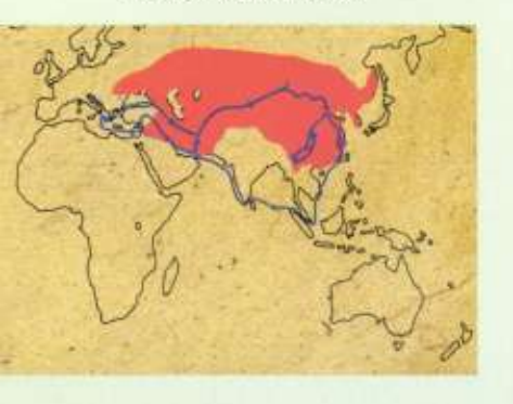
▲ A map showing the route covered by Marco Polo on his journey to and from China. The shaded area indicates the extent of the Mongol Empire at the time.