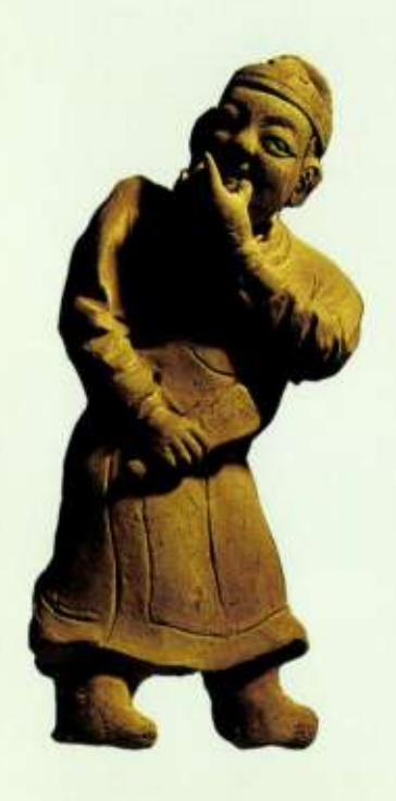
▲ A 13th Century figurine of a Chinese character actor, such as might have been found at Kublai Khan's court.