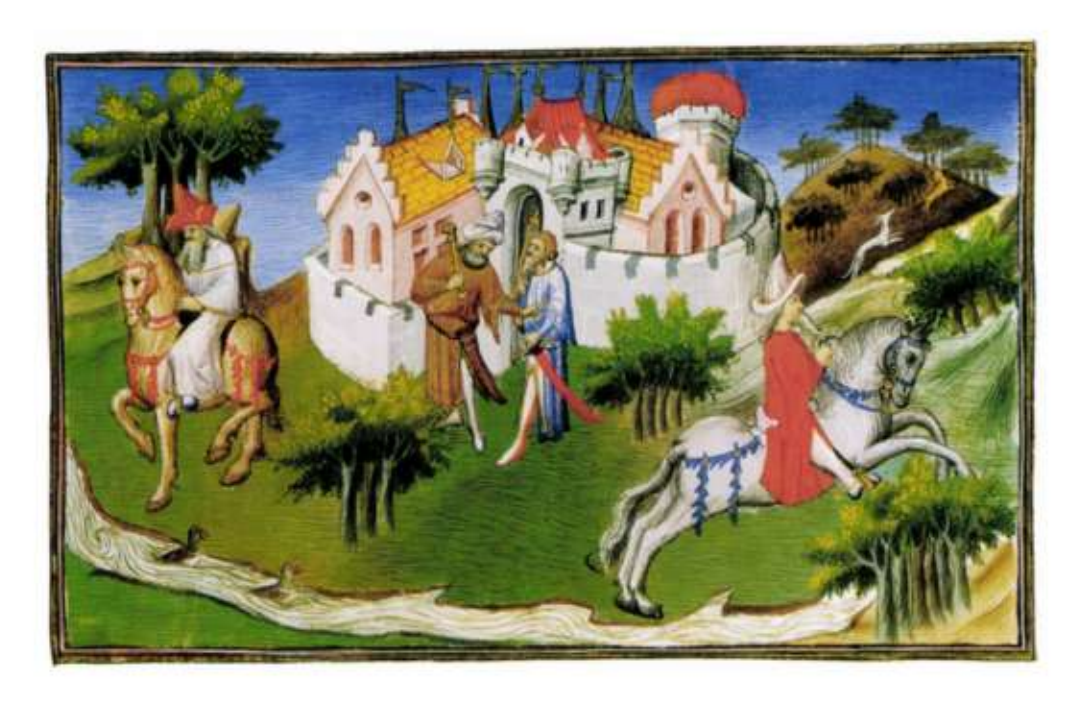
▼ Two illustrations (left and bottom left) taken from a famous 15th Century French edition of Marco's story. The upper picture shows the Khan's palace at Khanbalik (today the city of Beijing), the lower some nomadic shepherds met by Marco on his travels. The pictures are not accurate – the artist had no pictures to follow, just Marco's descriptions.

Finally Kublai Khan allowed the Polos to leave China. They returned to the West by sea along the Spice Route. Their ship sailed around India to the Persian Gulf, and from here they returned to Venice, arriving home in 1295.