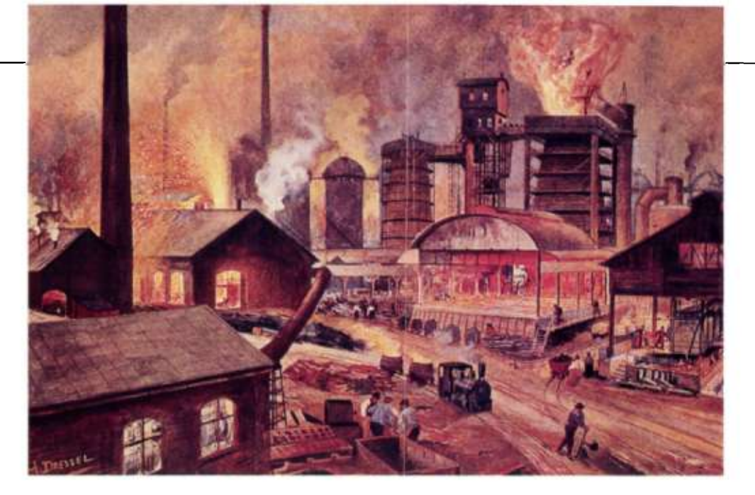
✓ View of a European iron foundry in c. 1900. The development of new processes in iron production laid the foundations for the Industrial Revolution that was to transform Europe from an agricultural society to an industrial one.

Renaissance, more European cities became actively involved in trade, generating the wealth to finance new universities and places of learning. Increasing European naval expertise led to discoveries from the Fifteenth Century which opened up still further possibilities for trade – a route to India around Africa, bypassing the Middle East, and even of a 'New World', America. By the start of the Eighteenth Century, Europe's command of the seas had led to its increasing domination of the world's trade markets and the slow erosion of the ancient trade patterns of the Silk and Spice Routes.