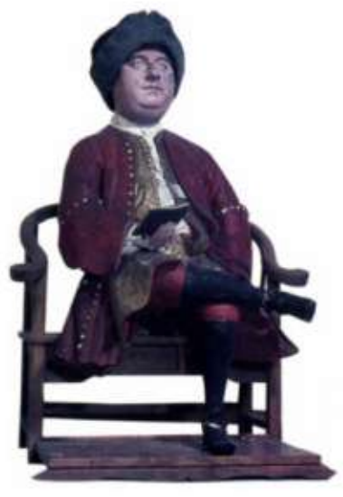
▲ Pottery models of European merchants, made in China c. 1730. This type of figure was made as a souvenir and taken home by the merchants and sailors.